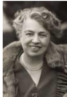
THE HONORABLE ELEANOR ROOSEVELT